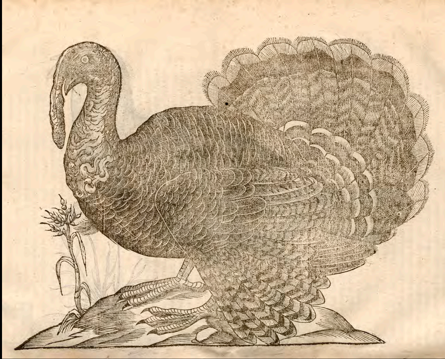
6. Ulisse Aldrovandi, "Gallopavo mas cum oryza," Ornithologiæ tomus alter...cum indice copiosissimo variarum linguarum (Bologna: Giovanni Battista Bellagamba, 1600), 39. Repository: Library of Congress Rare Book and Special Collections Division Washington, D.C. QL673 .A36 © Library of Congress, Rare Book and Special Collections Division