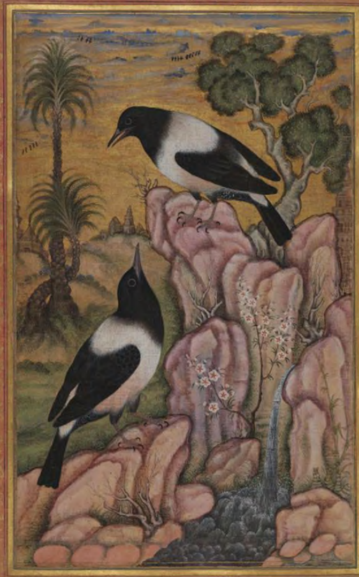
7. Artist unknown, A Pair of Rosy Pastors, ca. 1570; page from the Jahangir Album, early seventeenth century. Repository: Staatsbibliothek zu Berlin, Stiftung Preußischer Kulturbesitz, Orientabteilung, Libr. Pict. A117, fol. 17v