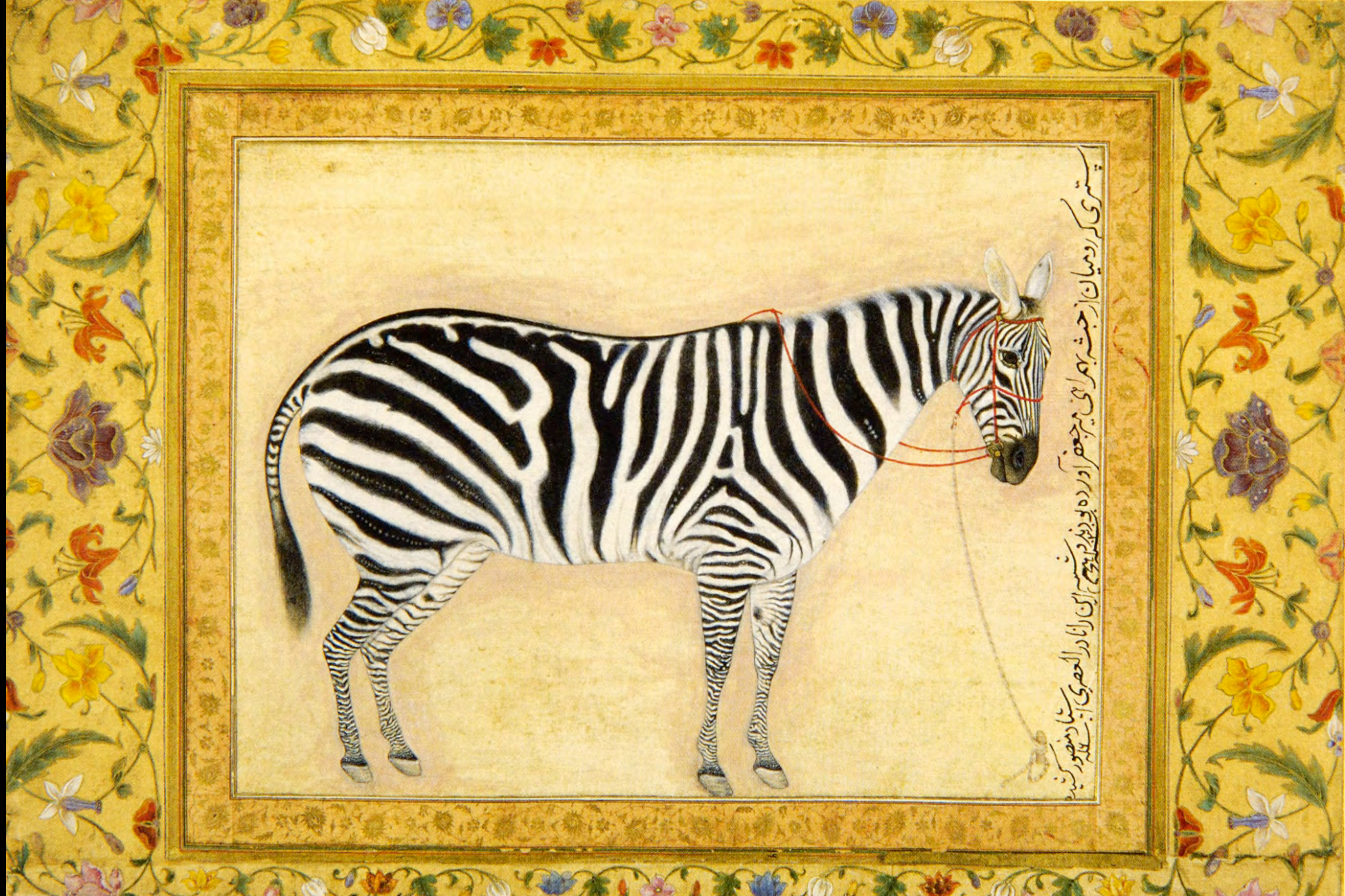
3. Mansur, Zebra, 1621, opaque watercolor and gold on paper. Repository: Victoria and Albert Museum, IM.23-1925