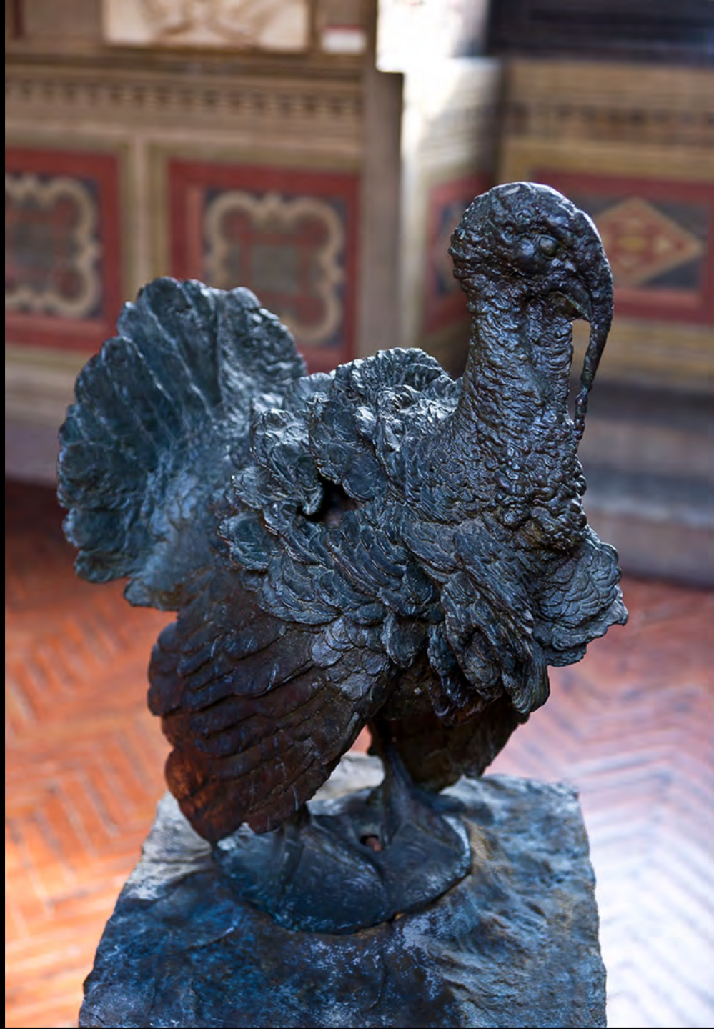
4. Giambologna, Turkey, ca. 1560, bronze. Repository: Museo nazionale del Bargello, Florence.