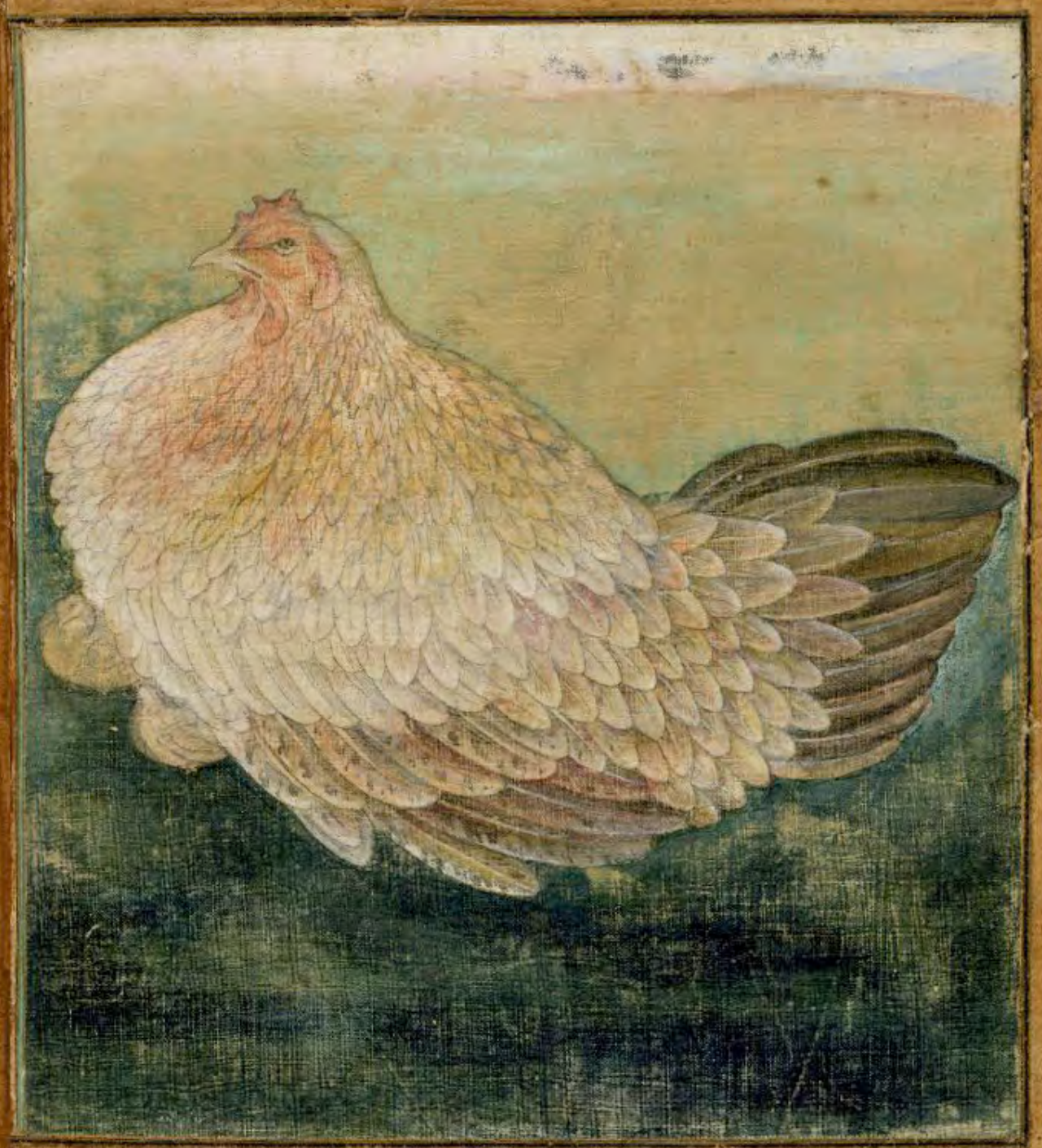
8. Mansur, Hen and chicks, ca. 1610, ink and opaque watercolors on cotton. Repository: British Museum, 1953,0214,0.2