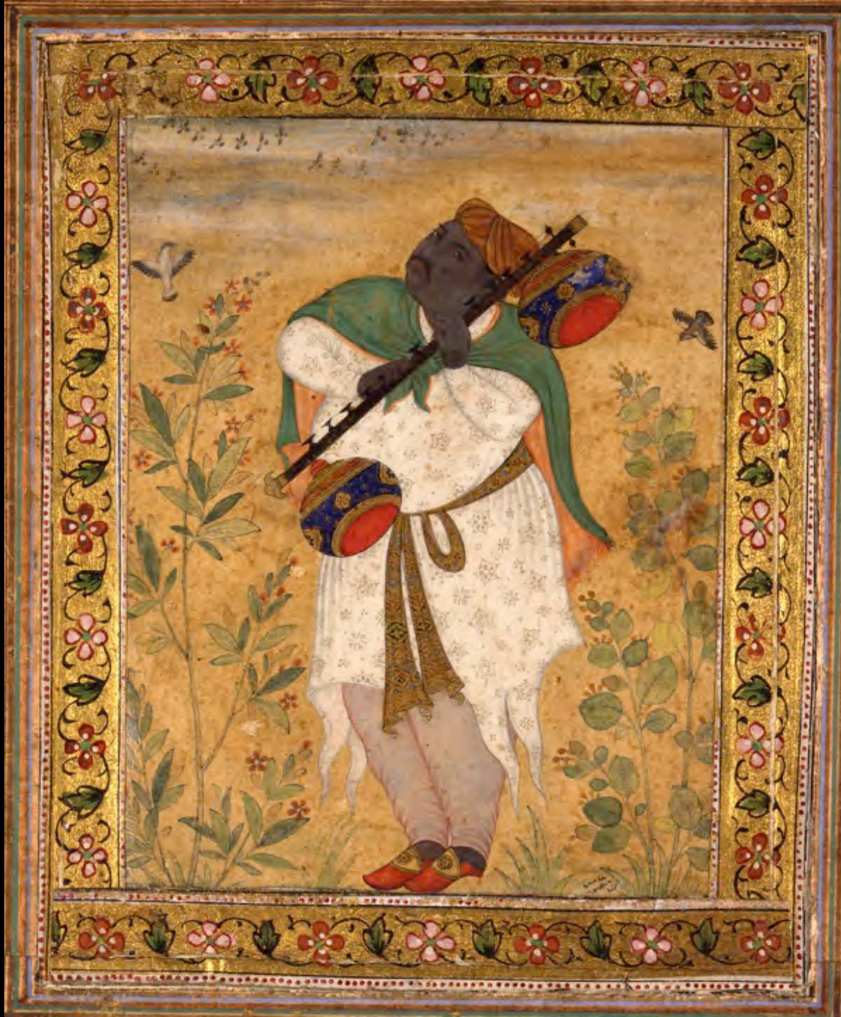
9. Mansur, Portrait of musician playing the vina, ca. 1605–06, gouache on paper. Repository: British Museum, 1989,0818,0.1